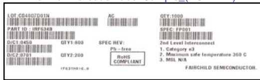
Outer Box Barcode Label Sample_(BBX)